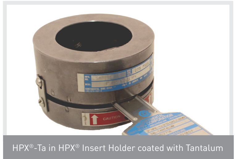
HPX®-Ta in HPX® Insert Holder coated with Tantalum

*Fluoropolymer liners are available on the process side of the rupture disc for: 1", 1 ½" discs rated > 30 psig @ 72°F 2" - 12" discs rated > 25 psig @ 72°F